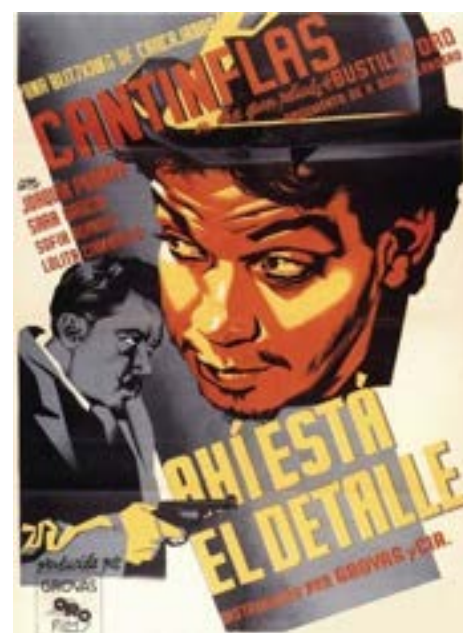
YOU'RE MISSING THE POINT September 4, 21, and October 1