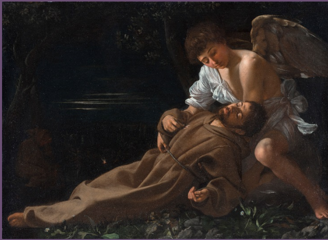
Michelangelo Merisi da Caravaggio, Saint Francis of Assisi in Ecstasy, c. 1595–96, oil on canvas, Wadsworth Atheneum Museum of Art, Hartford, Connecticut, The Ella Gallup Sumner and Mary Catlin Sumner Collection Fund, 1943.222.

Toward the end of the 16th century, a new subject was invented: Francis in ecstasy, supported and consoled by an angel after the stigmatization. The subject may have been first introduced by Michelangelo Merisi da Caravaggio in a canvas painted in Rome circa 1595–1596, now in the Wadsworth Atheneum Museum of Art, Hartford, Connecticut.