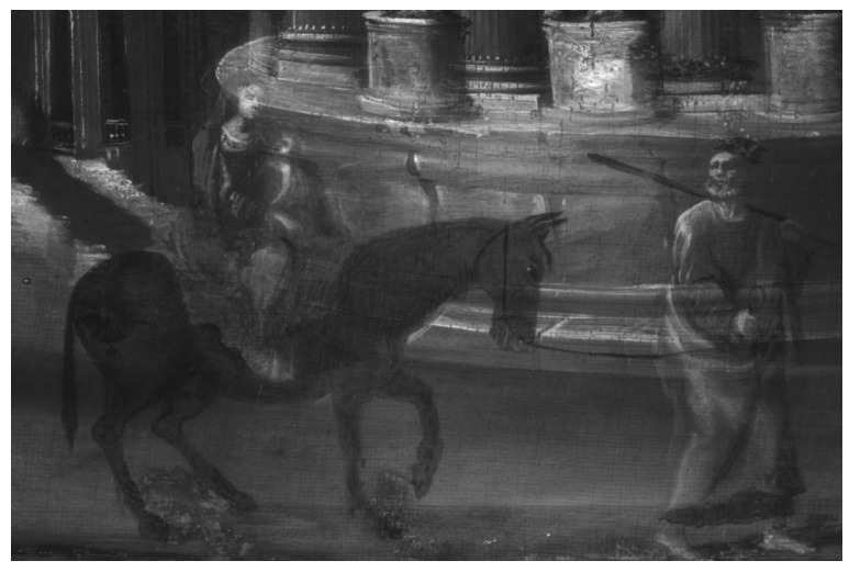
Figure 2. Detail of infrared reflectograph showing figures painted thinly on top of architectural elements already brought to a state of high finish.

The paintings previously attributed to Desiderio are now considered to be the work of Nomé and Didier Barra, and possibly a third, unknown, painter. (Wittkower 1958).