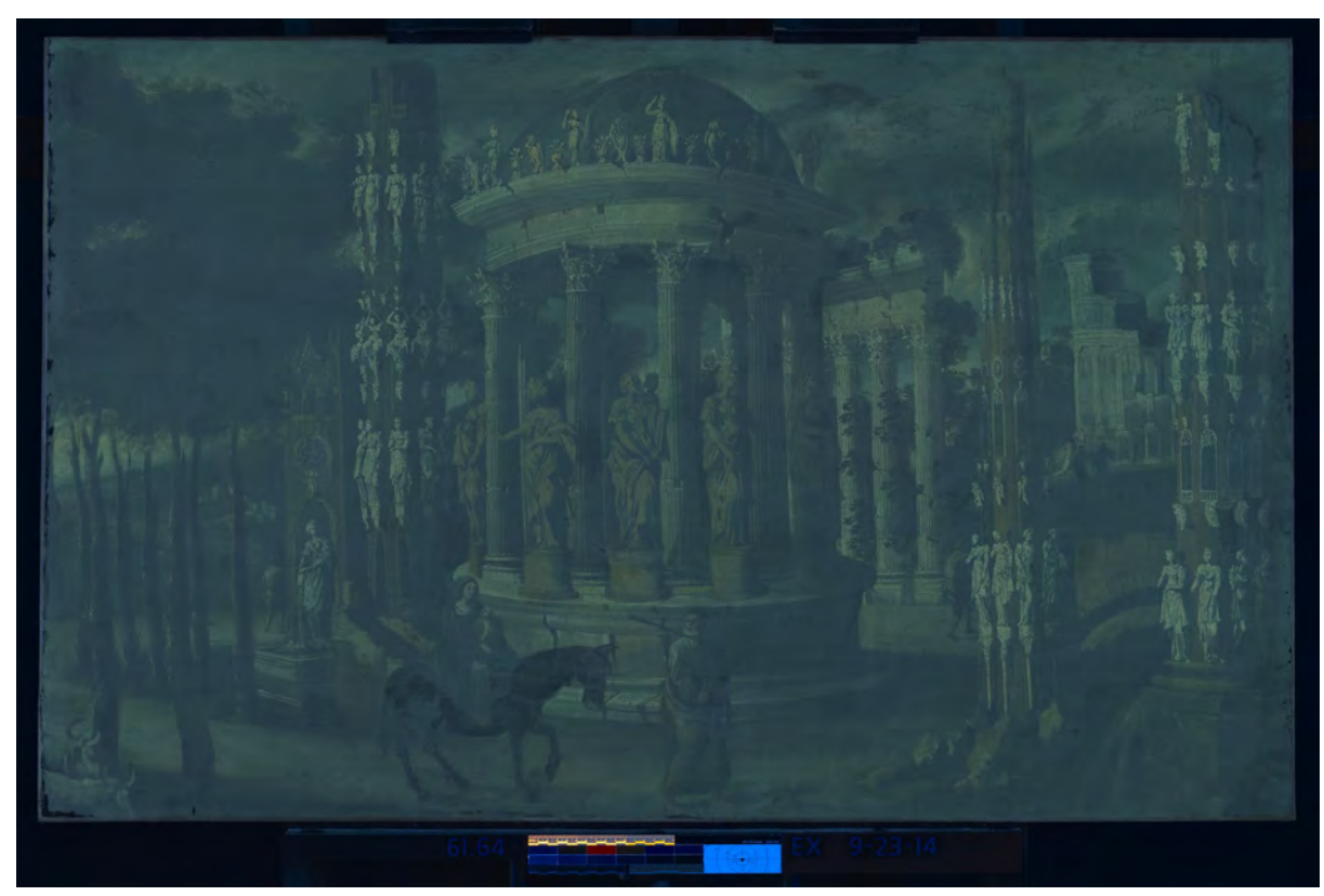
Figure 12. The Flight into Egypt, recto in longwave ultraviolet radiation.