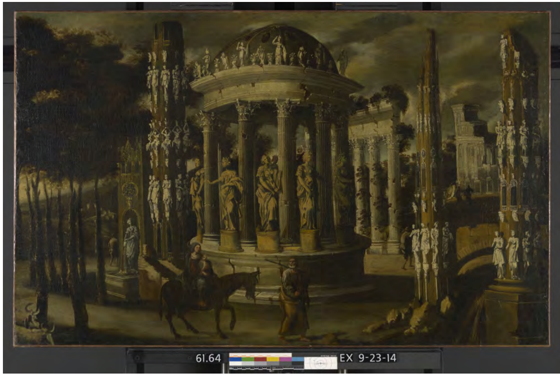
Figure 9. The Flight into Egypt recto, normal light.