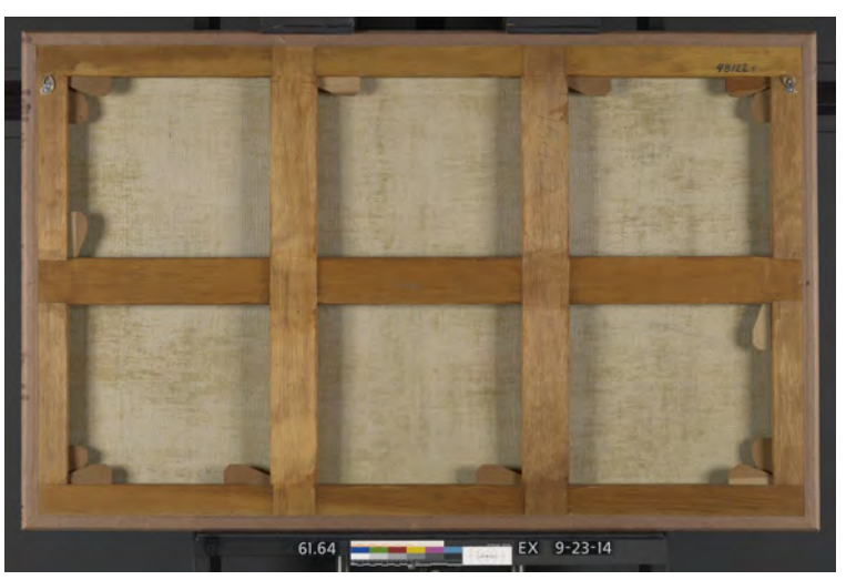
Figure 4. The Flight into Egypt verso in normal light.

The tertiary support is a basket-woven (2/2 plain weave) lining canvas likely attached to the primary support with a