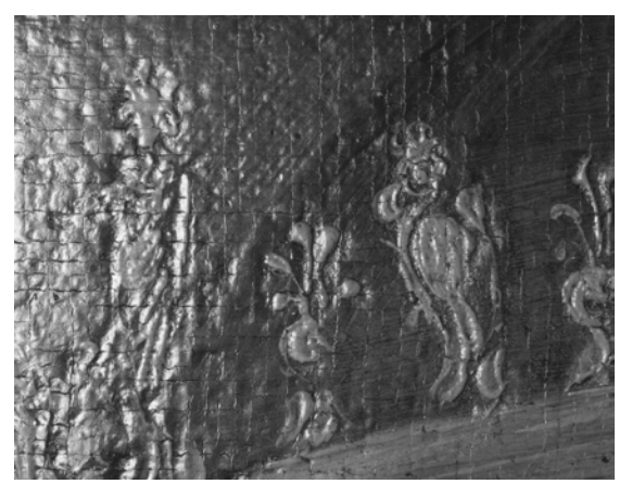
Figure 7. Specular highlight detail of weave enhancement and moating around impasto.

There is a strong overall craquelure in a grid pattern, called pavimenteuse, which is commonly seen in Neapolitan canvases and is a result of the coarse. open weave. The paint layer has suffered dramatically from multiple lining processes. The high heat and pressure applied during aqueous linings, such as those evident here, can significantly deform an oil paint layer. The painting has had an overall loss of texture, and there is significant weave enhancement as the topography of the primary support has been pressed into the paint layer. There is also flattening and smoothing of, as well as moating around, the fine detailed impasto of the sculptural figures. There is loss to the paint layer throughout the painting associated with tears and the craquelure (see GROUND).