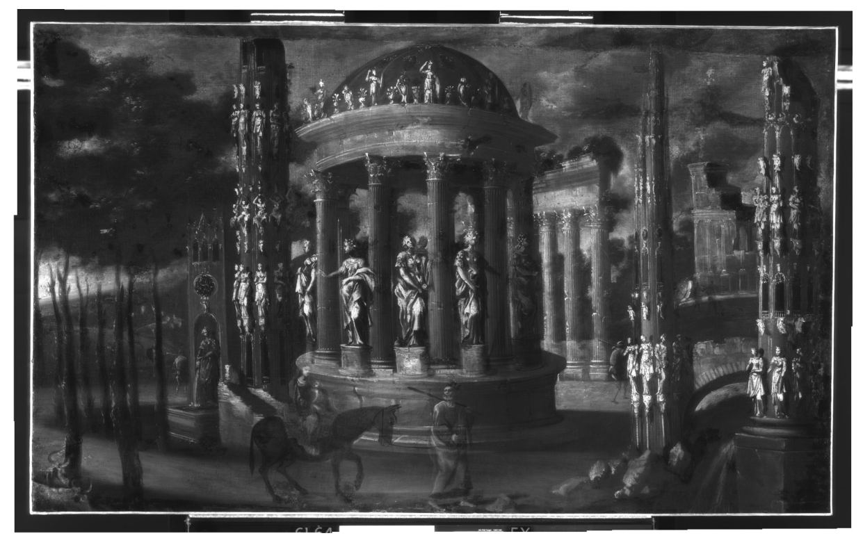
Figure 11. The Flight into Egypt, infrared reflectography image captured with an Osiris Infrared Imaging System (InGaAs array sensor) in six sections and composite image created in Adobe Photoshop CS6.