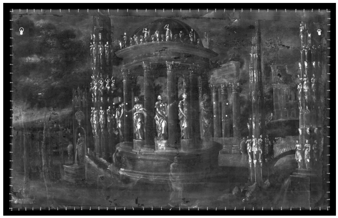
Figure 10. The Flight into Egypt , x-radiography image captured with Pantak-Seifert x-ray tube at the following parameters: 25kV, 3 µA, 45 seconds, 40" distance from tube. Captured in 20 sections, composite image created in Adobe Photoshop CS6. Image digitally altered by the author to minimize the appearance of stretcher bars.