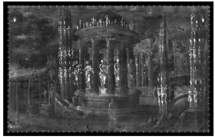
Figure 5. The Flight into Egypt x-radiograph. Note compositional elements not associated with the Nomé composition at the upper and lower edges.

The original, primary support is a coarse plain-woven canvas with wide-set cusping on the right and left edges, which may indicate preparation layers were applied on a looped working strainer. The absence of cusping on the upper and lower edges as well as the diagonal. straight trimming inside of the original tacking edges suggests a change to the format and dimensions of the painting. This is supported by the sharp cutoff of the spires in this composition. where restored sections at the upper edge are restored to sky rather than continuing the spire. as well as a lowered aspect ratio from Nome's other compositions, which often have