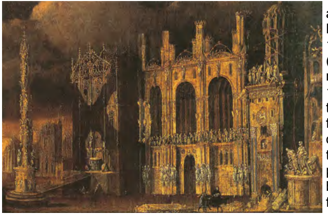
Figure 3. François de Nomé, The Flight into Egypt , 1624, Musée des Arts Decoratifs. Image scanned from Marandel, 1991, p. 39.

artist Jacob van Swanenburgh (1571-1638) and Neapolitan court painter Belisario Corenzio (1558-1643, Greek) among the proposed candidates (Whitfield 1982). The MFAH painting has a close relation in The Flight into Egypt dated by Nomé 1624 in the Musée des Arts Decoratifs in Paris. In this work, the tiny figures of the Holy Family pass a fantastical Gothic church, and are yet even more dwarfed by the towering, surreal architecture. Like the MFAH painting, the figures were the last to be painted, and were added thinly on top of background elements already brought to high finish.