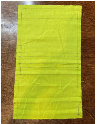
img 1.1 img 1.2

Fold the fabric in half and overlap your 1.5" ends and pin along the sides. (img 1.3)