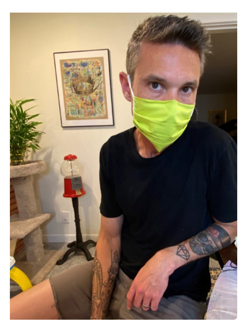
Step 17 Your mask is complete! Press and wash and place filter inside. (img 1.17)