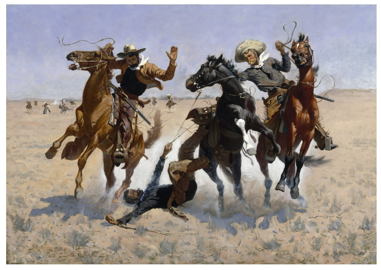
Frederic Remington, Aiding a Comrade , 1889–90, oil on canvas, the Museum of Fine Arts, Houston, The Hogg Brothers Collection, gift of Miss Ima Hogg, 43.23.